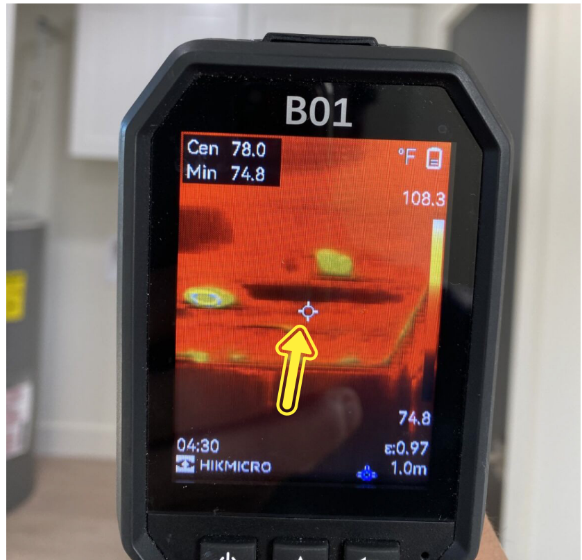
LOCATION: Mud Room